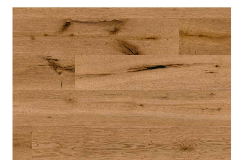
OAK NEW NOBLESSE Rustic, 4 sides beveled, brushed, natured oiled