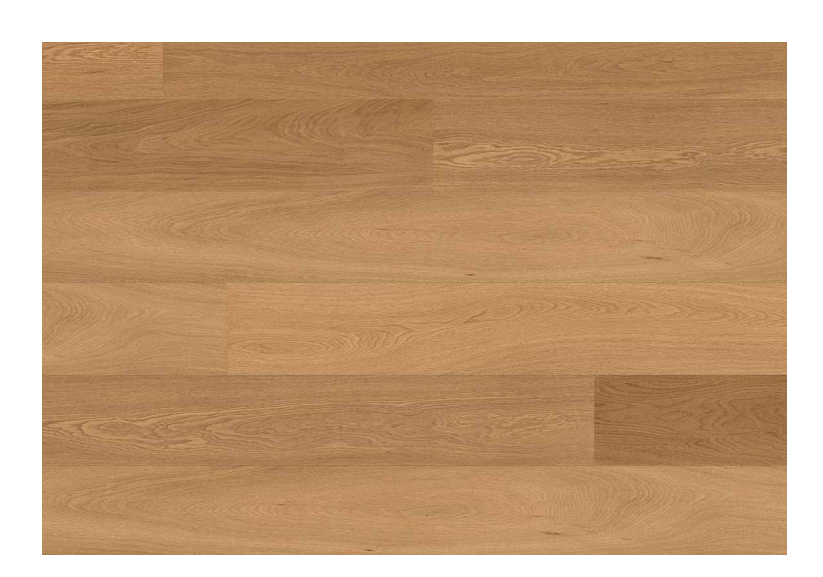
OAK NEW LINHART Nature, 2 sides beveled, brushed, natured oiled